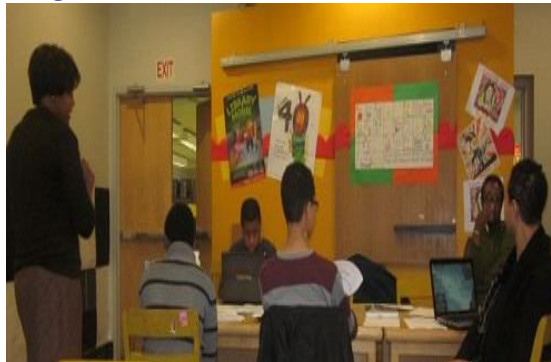
The chapter wishes the SITES students, pictured here in a practice session, good luck in the Regional IT Showcase Competition in Bowie, MD on June 18!